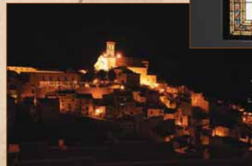
Night Sight of the Old Part of the City