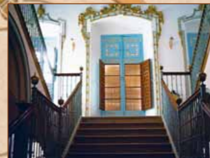
Imperial staircase of The Town Hall in rococo style.