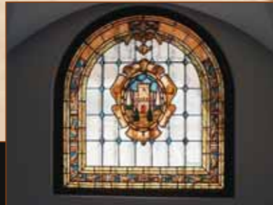
Stained glass window of the Archaeological Museum