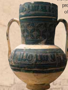
Muslim engraved jar S. XII

Although the current settlement of the city of Cehegín took place in the Middle Ages with regard to an Islamic settlement, we must get back to several centuries ago to deepen in its origins. It is a known fact that shelters and caves of Peña Rubia were used since the Neolithic as burial places, lasting as a sacred tradition for several centuries. There are many arqueological sites which give evidence of the transition of the main prehistoric cultures and of Antiquity in these lands such as the Argarian and Iberian cultures.