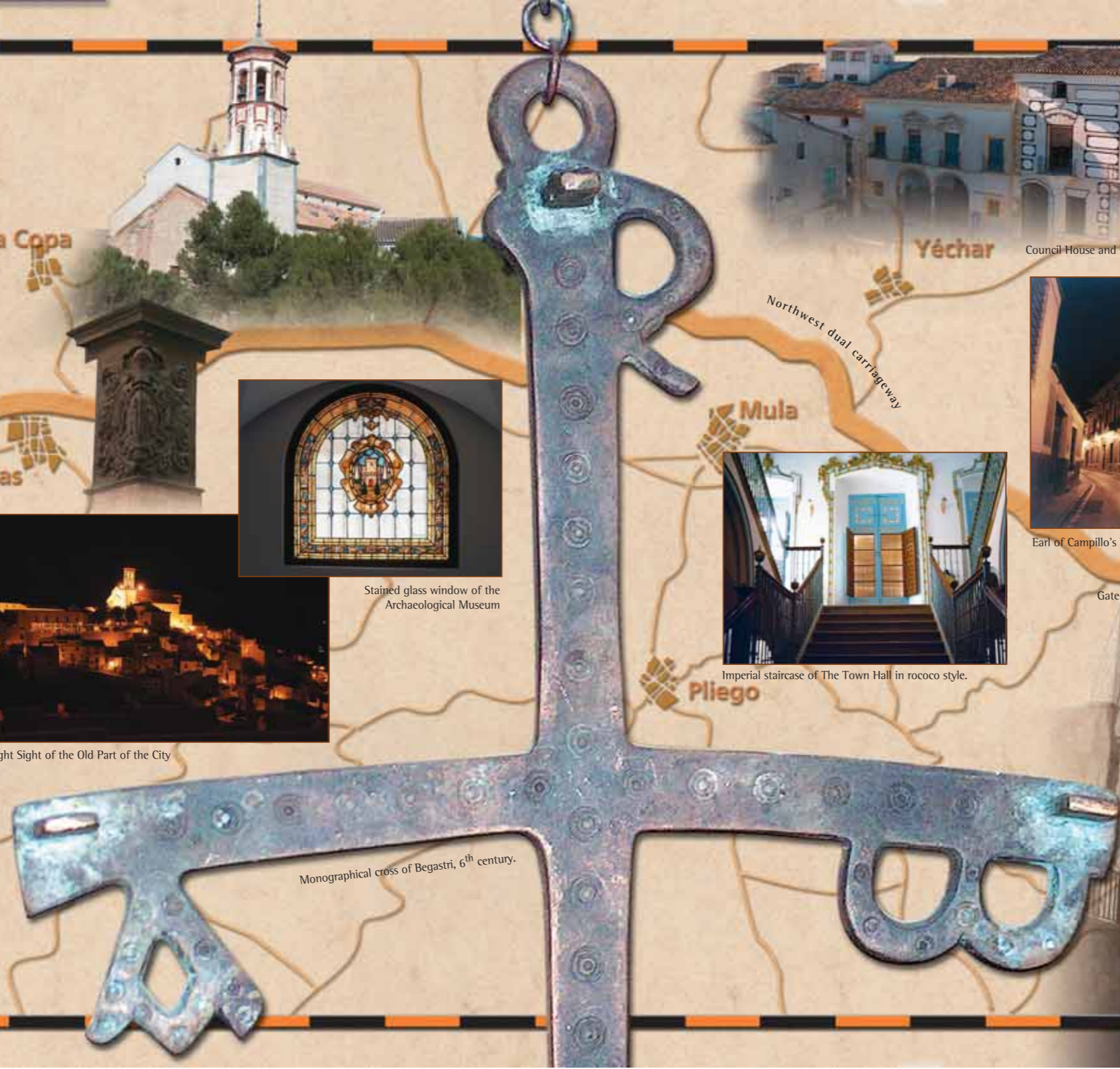
Monographical cross of Begastri, 6 th century.