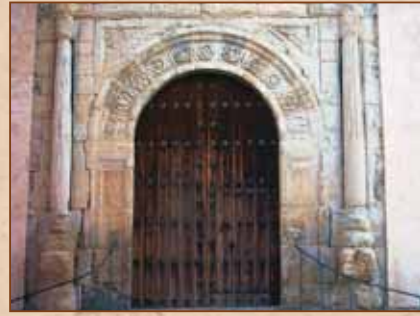
Renaissance facade church of Concepcion S. XVI.

The Culture Minister declared in 1982 as Artistic Historical Group those neighbourhood that took part in the urban setting before Contemporary Age period.